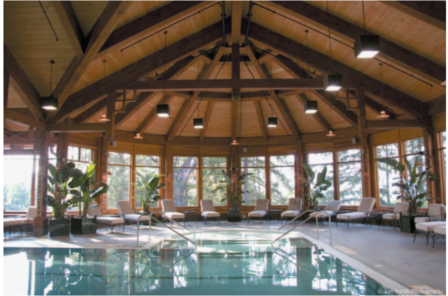
The Spa at Mohonk Mountain House, New Paltz, New York.