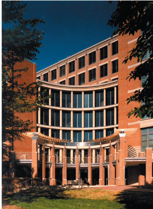
University of North Carolina Biomolecular Research Building